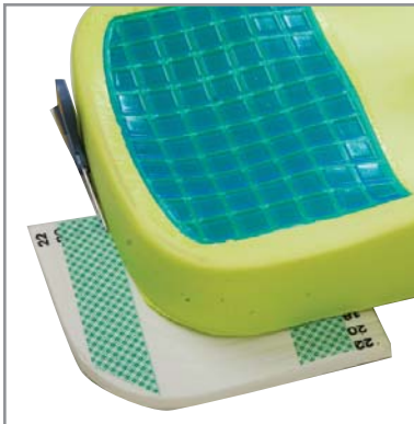
POK – Pelvic Obliquity Kit (2 pieces) accommodates up to one inch of obliquity